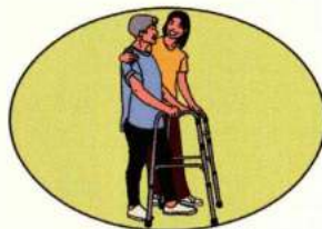
Walking or Moving Around