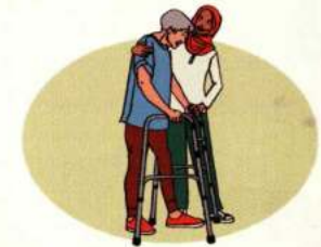
Daily Activities Assistance