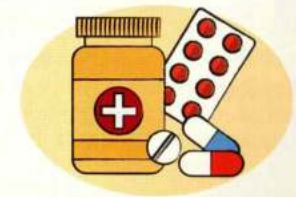
Medical Fees Assistance

You can submit your application for any of the long-term care schemes 1 administered by AIC at efinance.aic.sg .